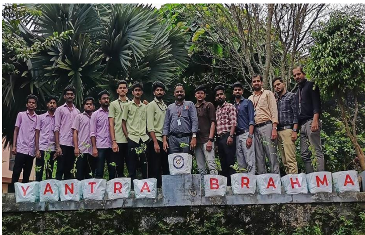
Mechanical Engineering Association as a part of Kalam Ko Salaam - Tree planting drive.