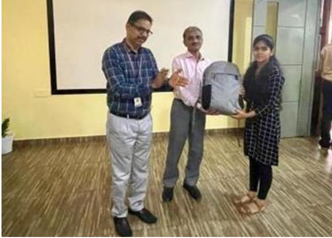
Distributing Laptops for students as a part of SAMATHWA scheme.

Centre, Palakkad, as the chief guest. He delivered a compelling technical talk on "The Role of Directorate of Industries and Commerce & Entrepreneurial Prospects."